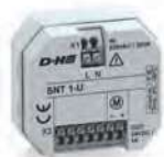
Power supply unit